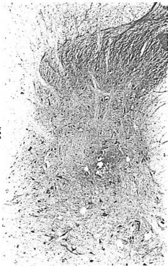
FIG. 3. An electrolytic lesion made through a recording electrode in lamina 5.

the analysis. This occurred only rarely, however.